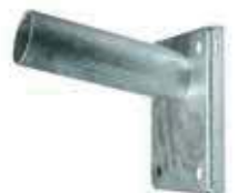
Steel Mounting / Wall Support 60 mm Suitable for all Street Light models Art. nr. 220-060